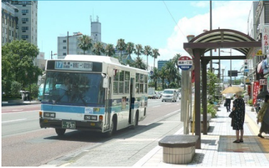
“Tachibana-dori Ichi-chome” bus stop.