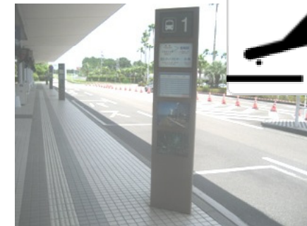
Airport Bus Stop #1